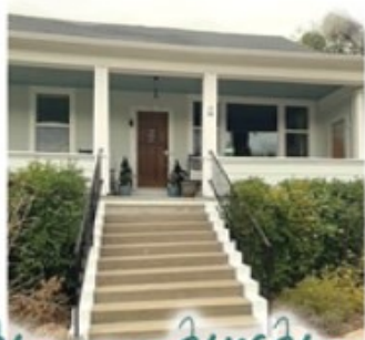
Harmony Hill House Event & Retreat Center Angel's Camp, CA