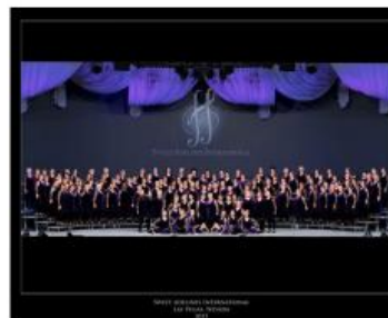
8 X 10

Choruses- Your posed photo is taken at the end of your performance after the applause have died down. Please keep in mind that the photographer, located in the center back of the room, will not be able to direct the group onstage so each member needs to be facing forward and may need to shift right or left in order to be seen.