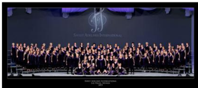
8 X 18

When ordering onstage chorus photos, we suggest choosing a more rectangular print size to accommodate the width of the stage. A black bar will be added above and below the image to make the group fit. See the example below: